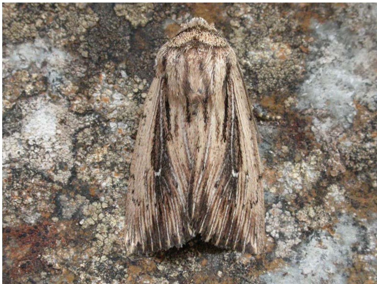
DEVONSHIRE WAINSCOT Mythimna putrescens