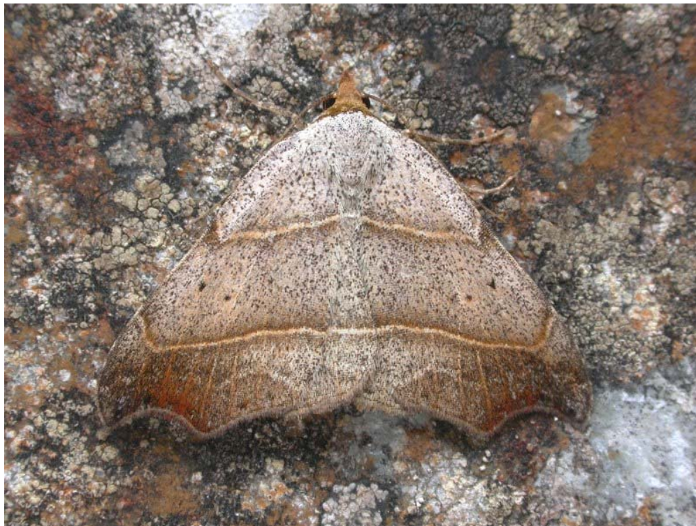
BEAUTIFUL HOOK-TIP Laspeyria flexula

It's been a few years without this species being recorded in the county, which is probably due to trapping habits and lack of targeting than any other factor. It's a scarce species that is rarely seen away from the Pembrey to Llanelli coastal marshes and wetlands.