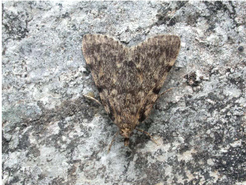
LARGE TABBY Aglossa pinguinalis