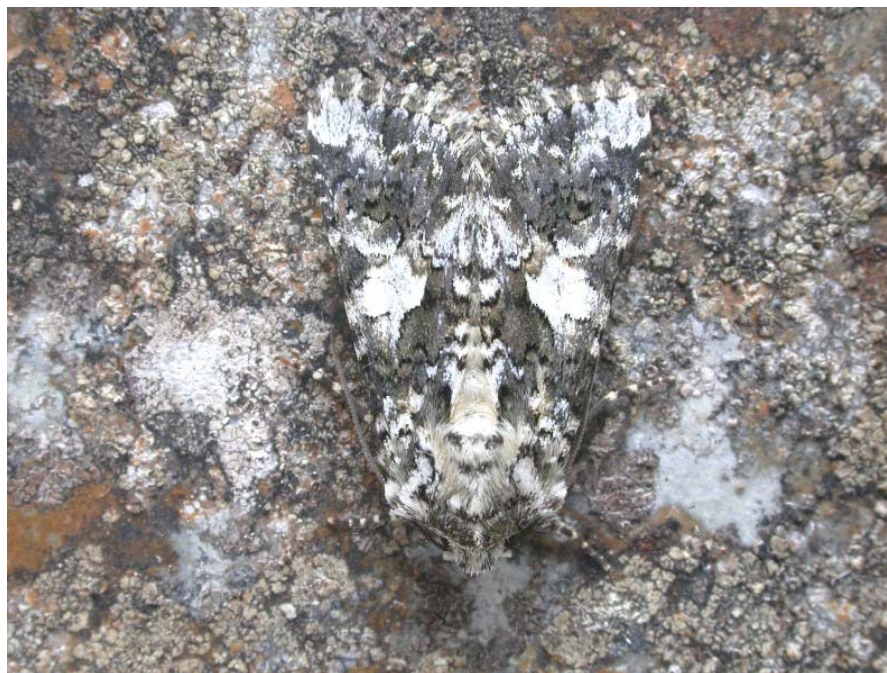
MARBLED CORONET Hadena confusa

Nearly 20 years since the last of a flurry of three records. I had suspected that the species was no longer resident in the county, but this record seems to say otherwise. Certainly the habitat for this record is far more appropriate. Lives on sea campion Silene uniflora and rock sea-spurrey Spurgularia rupicola .