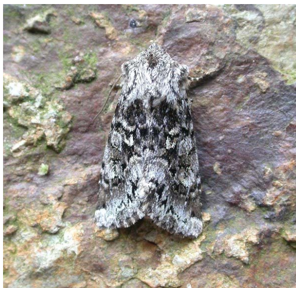
GLAUCOUS SHEARS Papestra biren

A species of moorland and mountains that sometimes wanders.