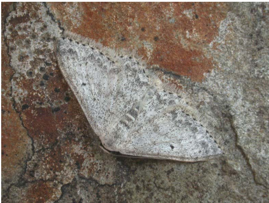
MULLEIN WAVE Scopula marginepunctata