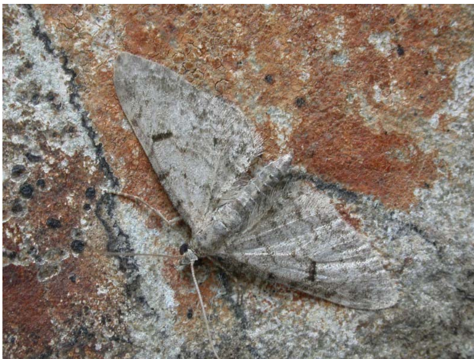
THYME PUG Eupithecia distinctaria constrictata

Still an uncommon species in the county, due to the scarcity of traveller's-joy Clematis vitalba .