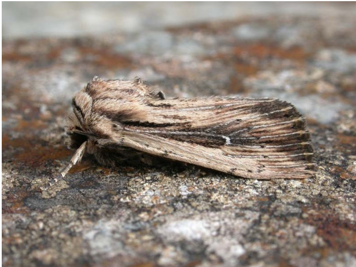
Devonshire Wainscot Mythimna putrescens The first county record for almost a century.