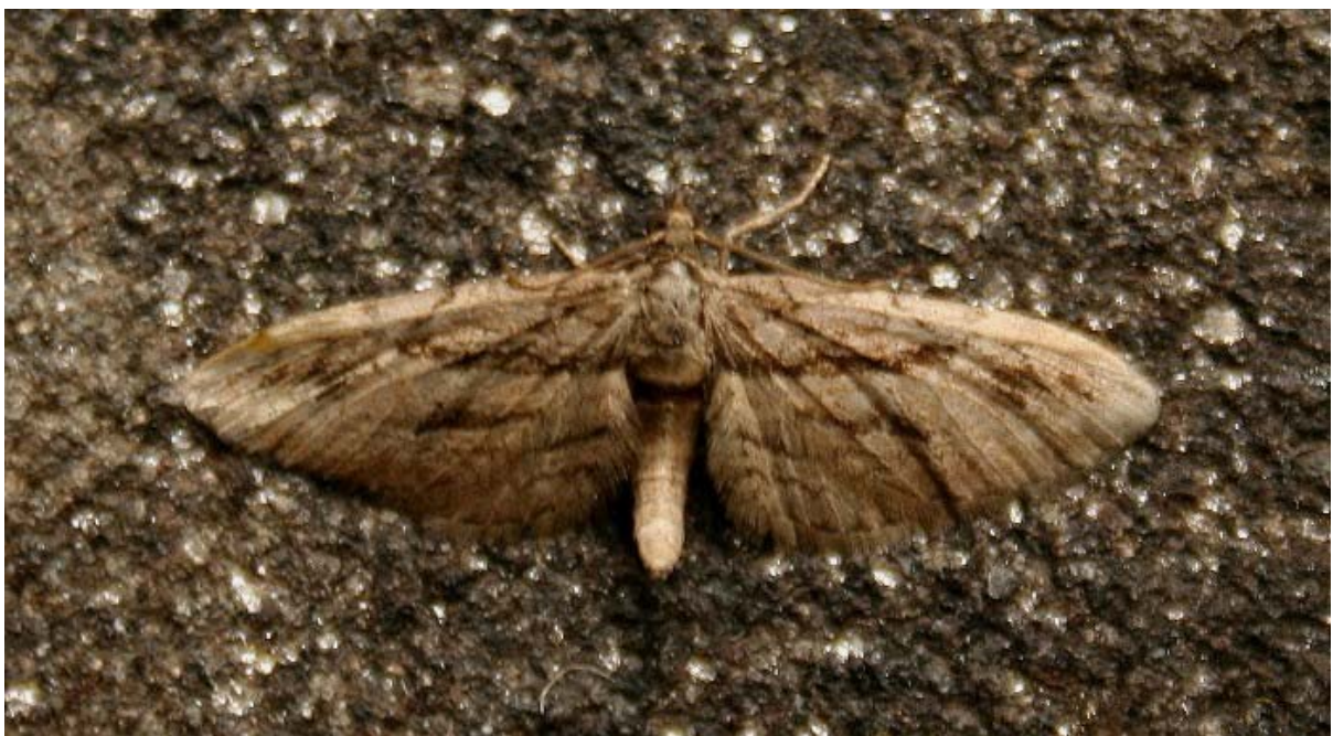
Cypress Pug Eupithecia phoeniceata