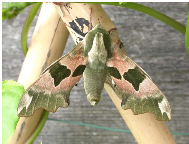
LIME HAWK-MOTH Mimas tiliae