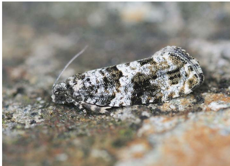
Gypsonoma oppressana

A new species of Tortricid for the county. Feeds on poplars Populus nigra and P. alba . Photographed.