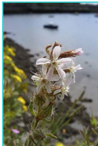
Small-flowered catchfly