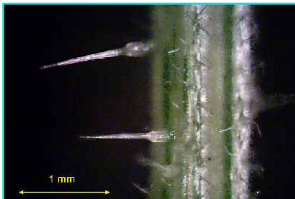
Nettle sting

The sting of our native nettle is nothing compared to some of its tropical cousins! One species in Timor causes a burning sensation and symptoms like lockjaw which can last for days or weeks!