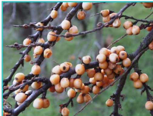
Sea buckthorn

So it would seem that the solution to this thorny problem would be to remove the plant from the sand dunes and restore access and the species rich grassland. However, sea buckthorn now covers such large areas that removing all of it would be very expensive. Therefore learning to live with sea buckthorn and finding ways to protect the dune grassland and access may be the only option.