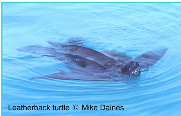
Leatherback turtle